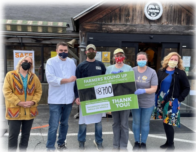
Woodstock Farmer's Market Round-Up Campaign for Meals on Wheels